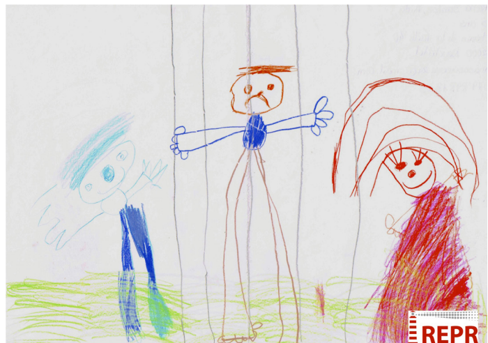
Drawing by Aida, one of five winners in Relais Enfants Parents Romands' 2017 art contest "Laura and Max visit their dad in prison": http://www.repr.ch

The views expressed in these articles do not necessarily reflect those of Children of Prisoners Europe, except where indicated.